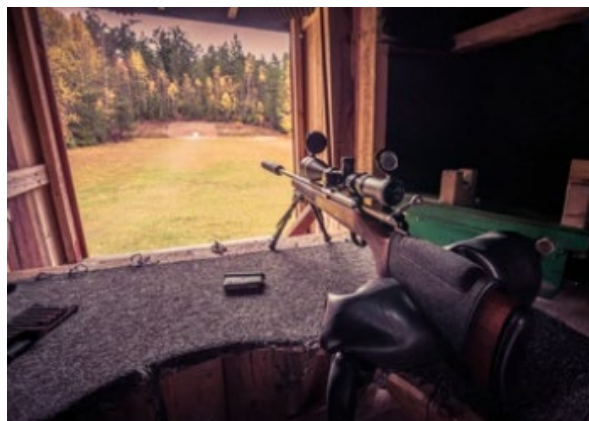
Benchrest can also be shot at 25 M using SFC-RIF-136 targets - scoring match.